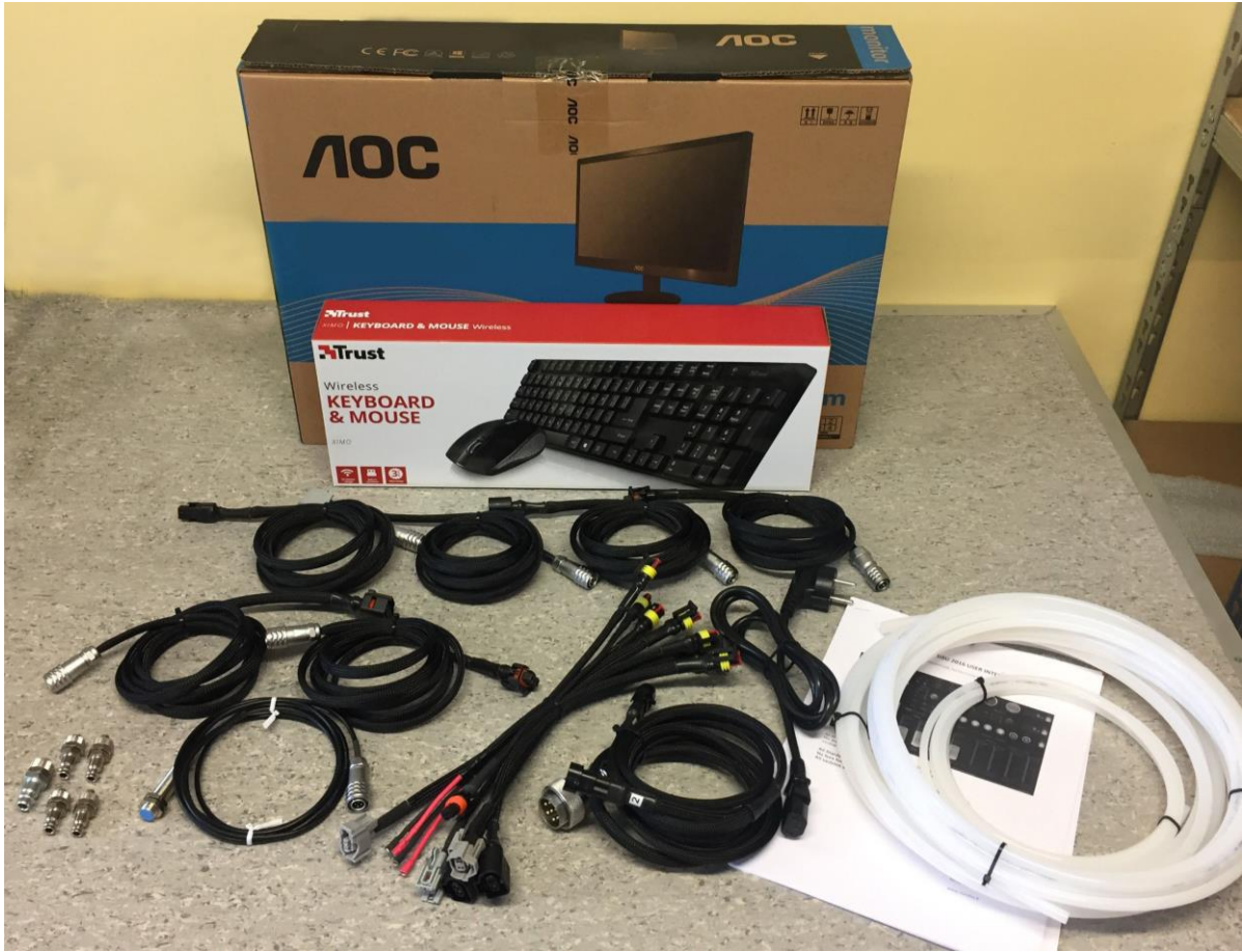
Supply kit photo